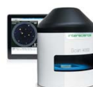
Scan® Automatic colony counters Inhibition zone readers