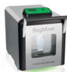
BagMixer® Lab blenders