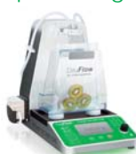
DiluFlow® Gravimetric dilutors