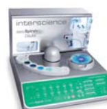
easySpiral Dilute® Automatic diluter and platers