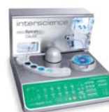
easySpiral Dilute® Automatic diluter and platers