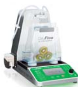
DiluFlow® Gravimetric dilutors