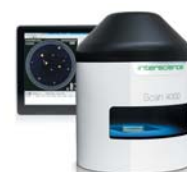
Scan® Automatic colony counters Inhibition zone readers