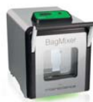
BagMixer® Lab blenders